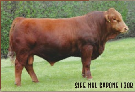
SIRE MRL CAPONE 130B