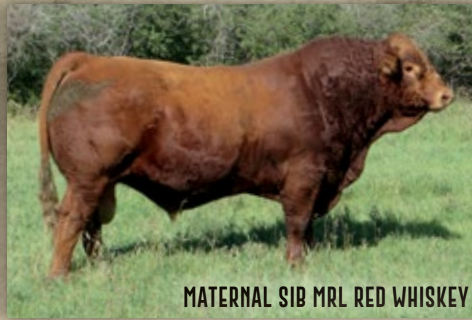
MATERNAL SIB MRL RED WHISKEY

MRL REGULATOR 148D POLLED RED PUREBRED BW 96 ADJ WW 865 • CSA#1184039