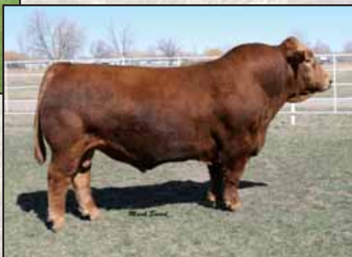
TNT Top Gun